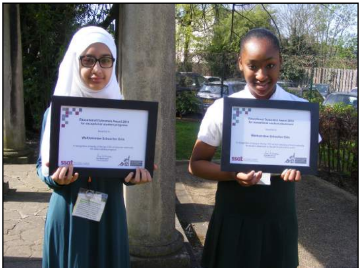
Year 8 students with the awards