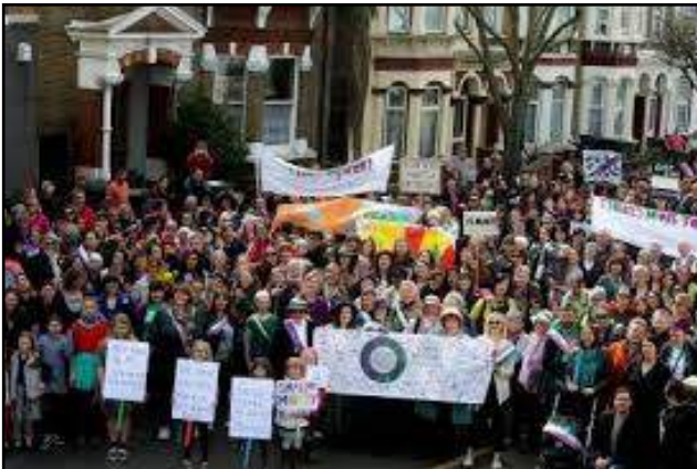
March in 2014

Young people under 18 must be accompanied by an adult (ie over 18). Boys under 10 will be admitted, but must be registered and attend the crèche.